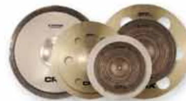
CRX Stack Packs

Designed to provide a great sounding, mid-priced option for today's drummers, CRX Classic , Rock and Xtreme cymbals are based on the same "High Contrast" tonal spectrum as their DRK, MDM and BRT TRX cousins. The lines include a full selection of cymbals created from our proven B20 Bronze formula and handcrafted to the highest standards.