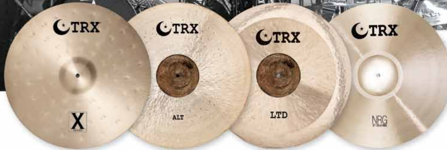
JP "Rook" Cappaletty • Josh Baker

These TRX cymbal series broaden and extend the range of "High Contrast" dark, medium and bright tonal options, TRX "X" Series features a "washed" and somewhat exotic sound. The ALT Series offers increased focus, a fast response and an all-around alternative for a variety of modern drumming styles. Our LTD Series has an exclusive, three-zone design that provides a combination of articulation and detonation. The NRG Series creates a powerful, high-frequency, high-energy sound on stage and in the studio.