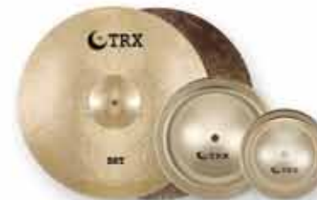
SFX Series DRK/BRT Hi-Hats and T-Bells