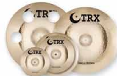
TRX Special Edition Add-Ons

Offering professional quality at a surprisingly affordable price, TRX Special Edition Series is an new class of cymbals that are recommended for all drumming levels, interests and abilities. The line is made from high-quality B20 Bronze that is 100% handcrafted and hand-hammered to create the look and sound of more expensive hybrid cymbals. TRX Special Editions are available in a full selection of Rides, Hi-Hats and Crashes individually and in popular box set configurations as well as a choice of Splash, China and Stacker effects add-ons.