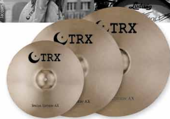
Special Edition AX

Super dry, super dark and recommended for jazz, R&B, rock and indie-pop, the CLS series features "Silver" B20 bronze and redefines "classic" cymbals. Available in Crash-Rides, Crashes, Thunders and Hats.