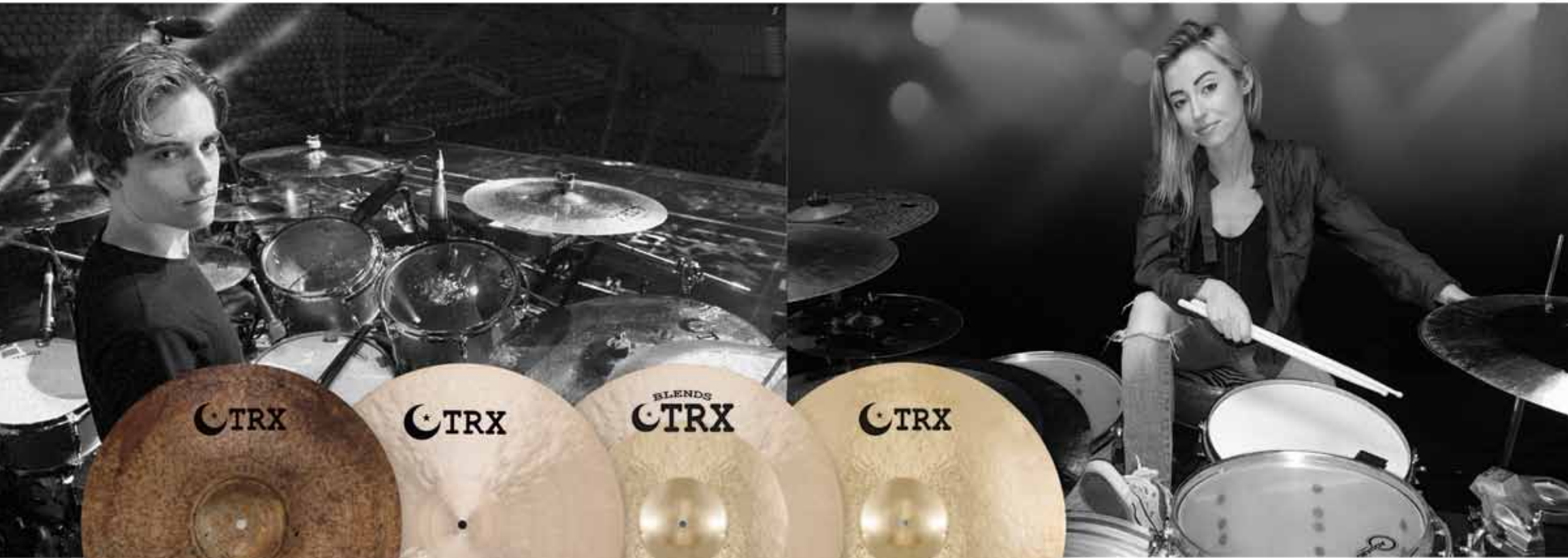
Elijah Wood • Lindsey Raye Ward

TRX's premium-quality, multi-series, "High Contrast" cymbals have been developed to cover every level of the sonic and musical spectrums—from high to low and jazz to rock. The TRX DRK Series is known for its dark, low-pitched, earthy sound. The TRX MDM Series is a mid-frequency, all-purpose line. TRX Blends combine our MDM and BRT Series to create a balance of warmth and brightness. The BRT Series is powerful yet musical with a higher pitch plus increased presence and projection.